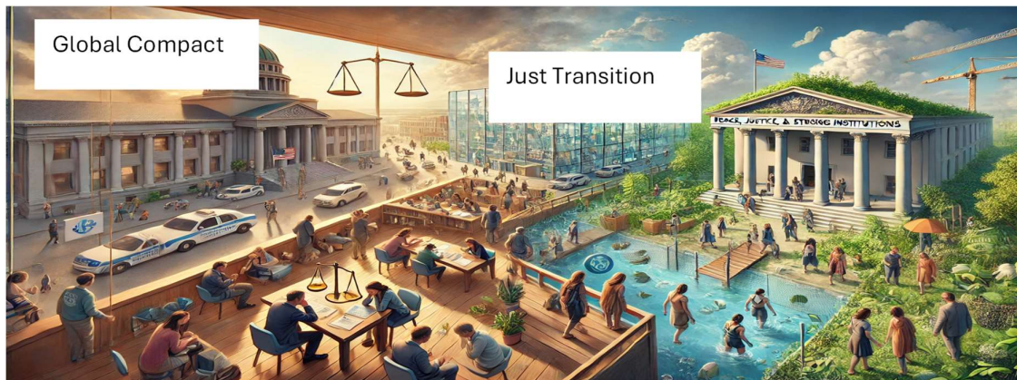
An AI-generated visual by the authors to reflect on GCM and Just Transition within the given context, and the related story in the following section reflects on some of the context noted in this box

The just transition approach —prioritizes social inclusion, culturally sensitive mental health support, participatory decision-making, green job creation, and regional cooperation—concretely operationalizes some of the GCM principles. By focusing on equitable economic opportunities, empowerment through participation, and transnational policy frameworks, it embodies the Compact’s goals of ensuring safe, regular, and rights-respecting migration pathways, especially in the context of climate-induced displacement (IOM, 2023)