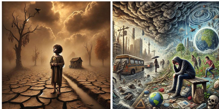
All AI Visuals Source: Nidhi Nagabhatla